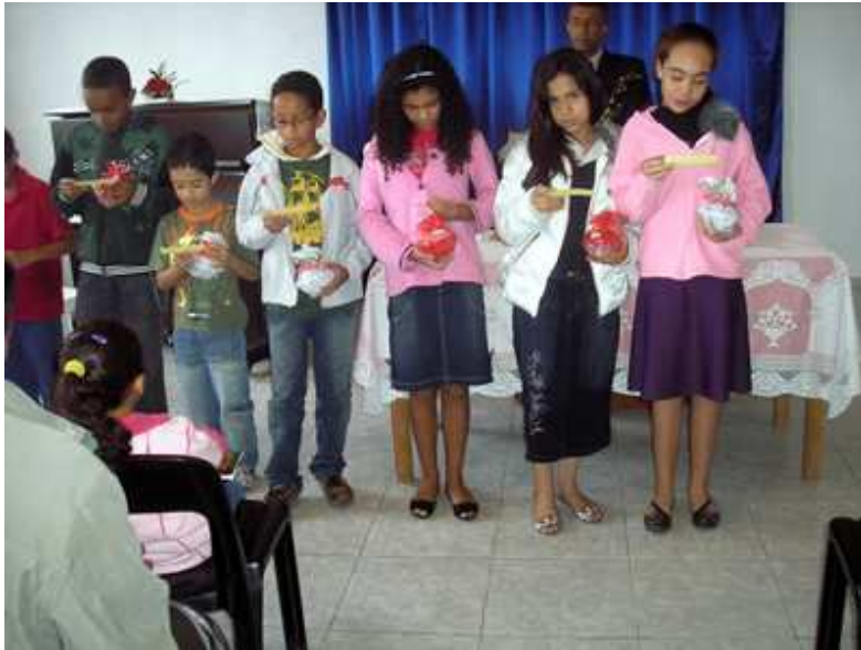
Mothers Day at the church in Mirante.